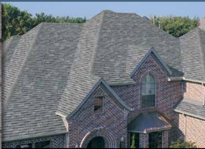
OLDE ENGLISH PEWTER