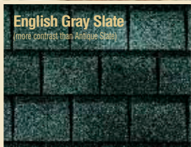
English Gray Slate (more contrast than Antique Slate)