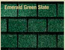
Emerald Green Slate