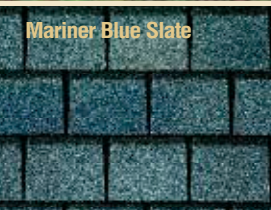
Mariner Blue Slate