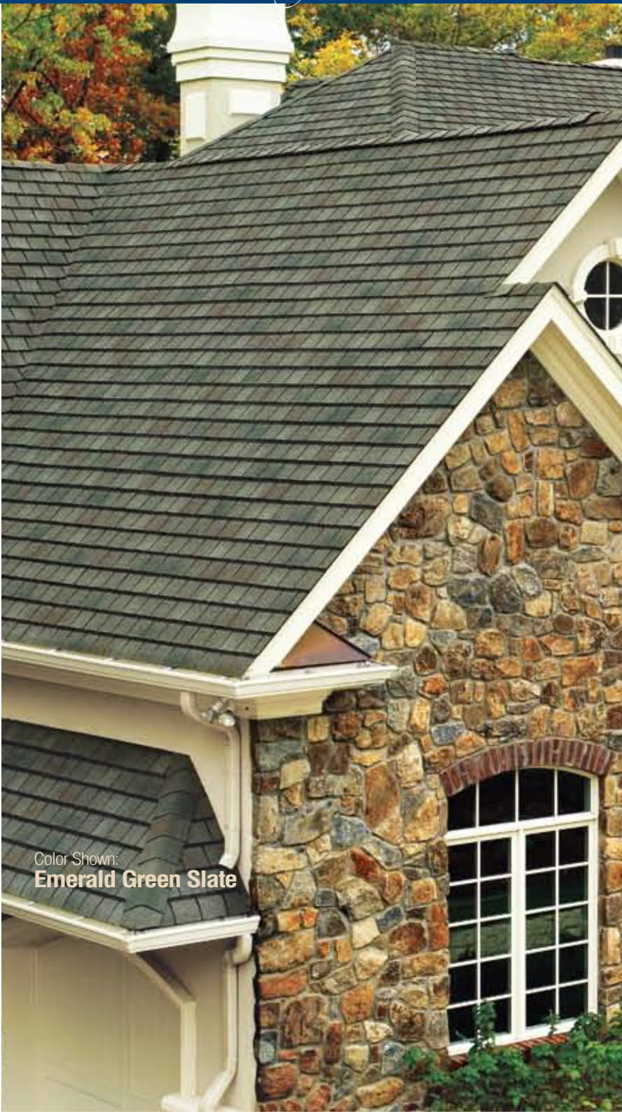
Color Shown: Emerald Green Slate

"The Look Of Slate... At A Fraction Of The Cost"