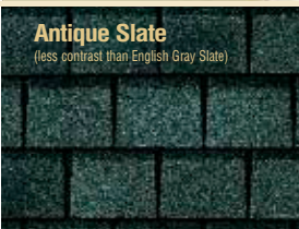
Antique Slate (less contrast than English Gray Slate)